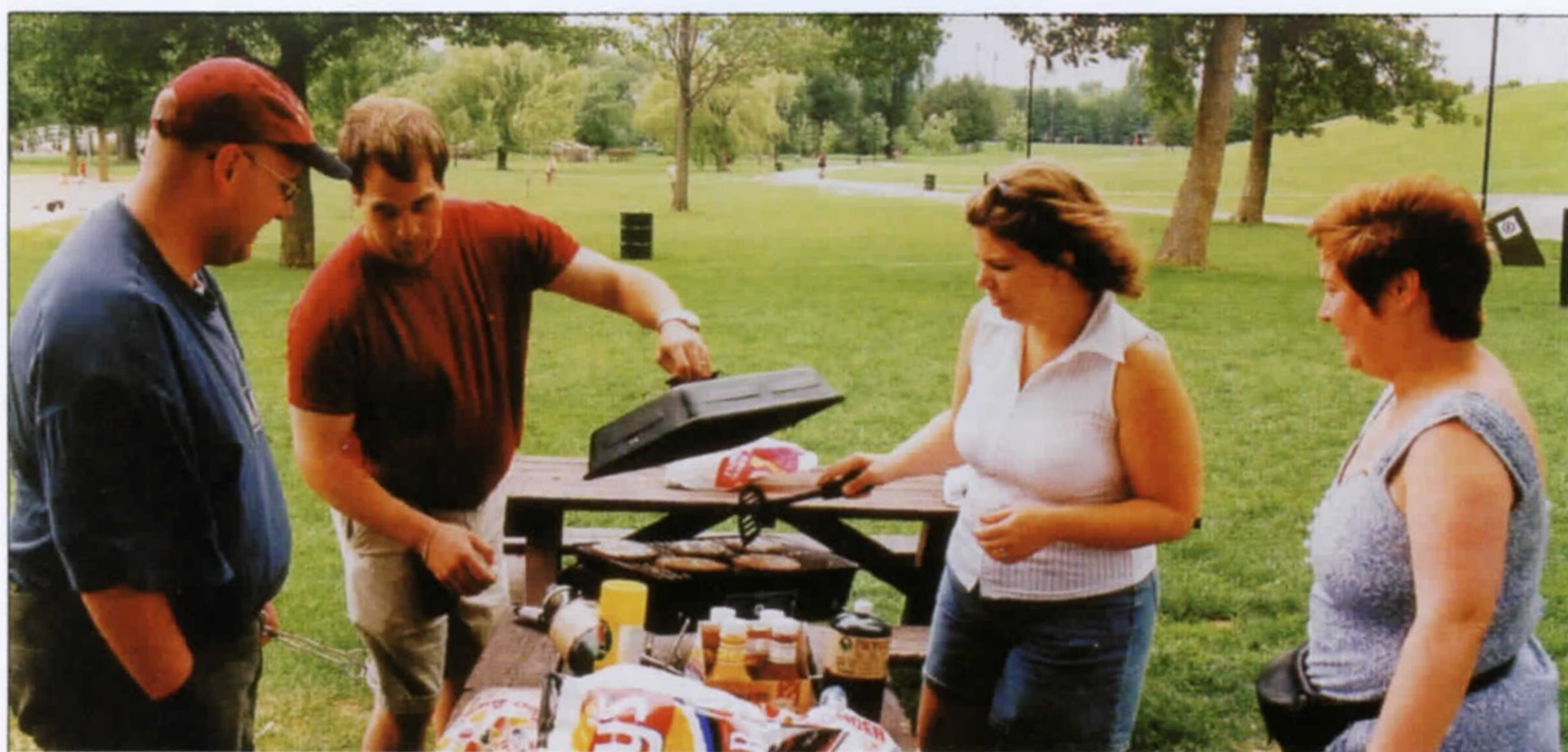
Hungry grads in the nation's capital.